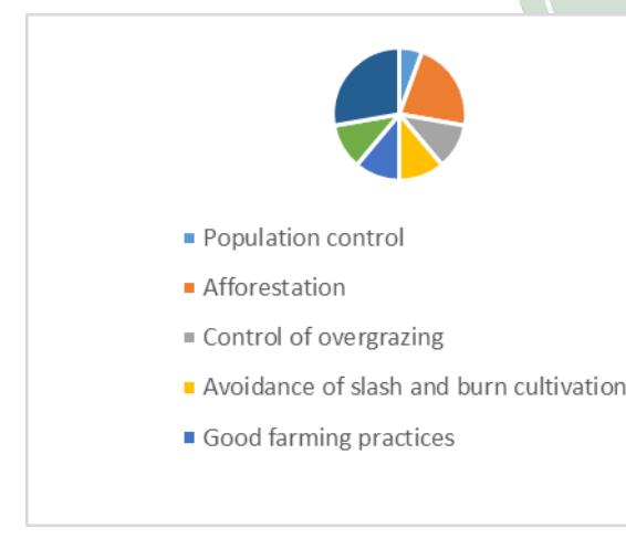
Fig. 5. Means of Controlling Desertification in Adamawa North areas.

The visible physical features of deserts that used to be peculiar to Sahel regions of Borno, Yobe Katsina, Kano, Jigawa, Gombe, Sokoto, Bauchi and Kebbi are gradually rearing their ugly heads in Adamawa North areas. The ground water level is now low, and the surface water dries up faster than usual, biodiversity is very low since the disappearance of the forests. Sand storms are now very common and windy particularly in the dry season. There is now a delayed raining season as against the past which starts in April. It appears therefore from the analysis all these symptoms of deserts are now common features of the environment particularly in the northernmost part of the region.