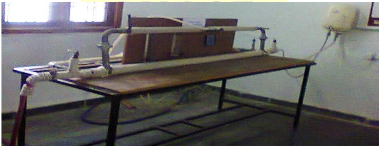
Fig. 2. Practically developed model of heat exchanger for parallel and counter flow.