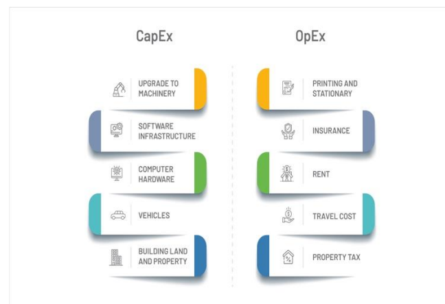
Figure 1: Differences between CAPEX Vs OPEX

subscriptions, and IT maintenance. The choice between these two financial models affects an organization's flexibility, scalability, and long-term sustainability.