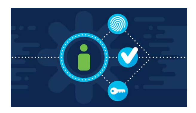
Figure 2: Defining Access Controls and Identity Management