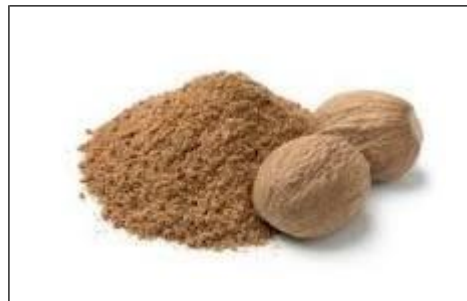
Fig.no 6:- Nutmeg powder

TherapeuticClass: Cosmeceutical,SkincareIngredient