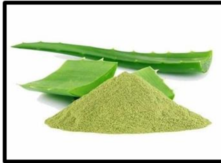
Fig no3:-Aloe powder

TherapeuticClass:Cosmeceutical,SkincareIngredient