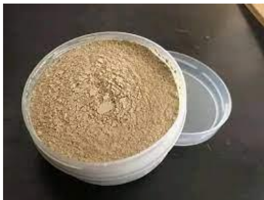
Fig no:-Herbal facepack