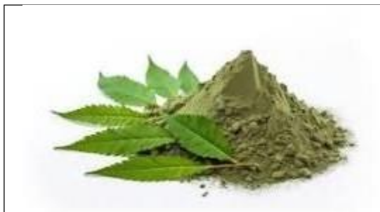
Fig no5:- Neempowder

TherapeuticClass:HerbalSupplement, Cosmeceutical