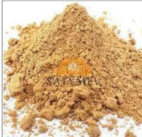
Fig no7:-Sandalwood powder

Mechanism of Action: Sandalwood contains various compounds that contribute to its therapeutic effects on the skin when used in face packs: