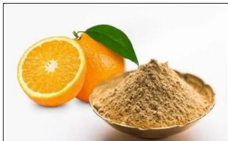
Figno2:- Orange peel powder

Therapeutic Class: Cosmeceutical, Skincare Ingredient